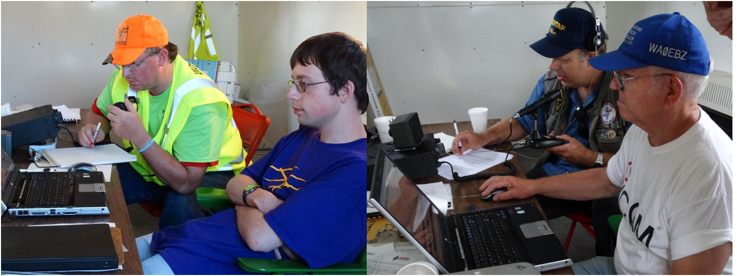
LOOKING PRETTY SERIOUS