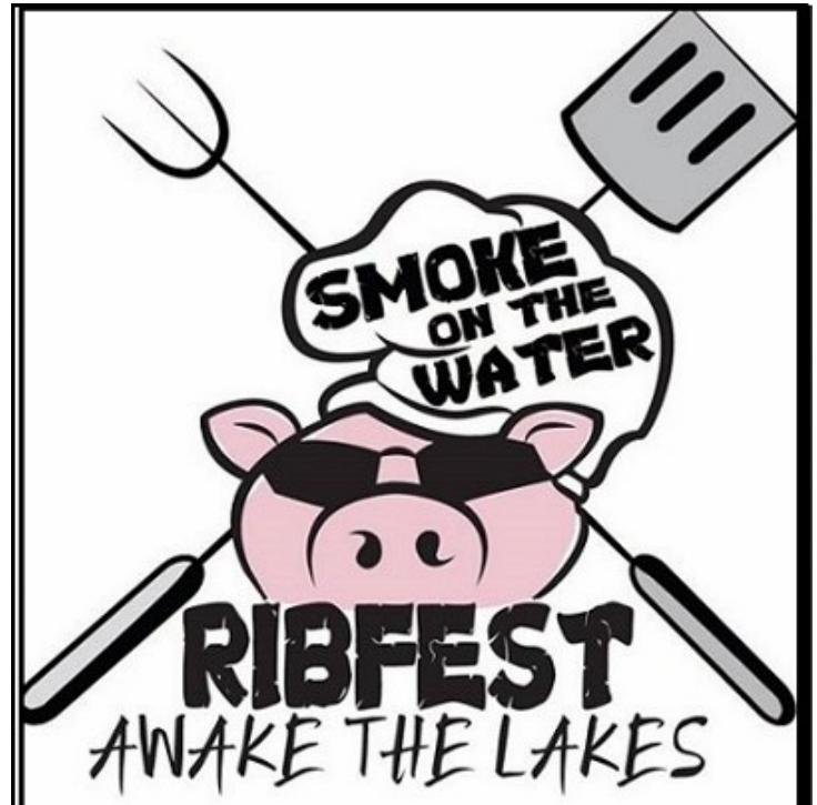
MEN AT WORK.....?

SPECIAL THANKS TO GEORGE N0RCL FOR SECURING THE SITE THIS YEAR AND ARRANGING FOR A GREAT COVERED MOBILE SHELTER FOR OUR USE...WORKED GREAT!